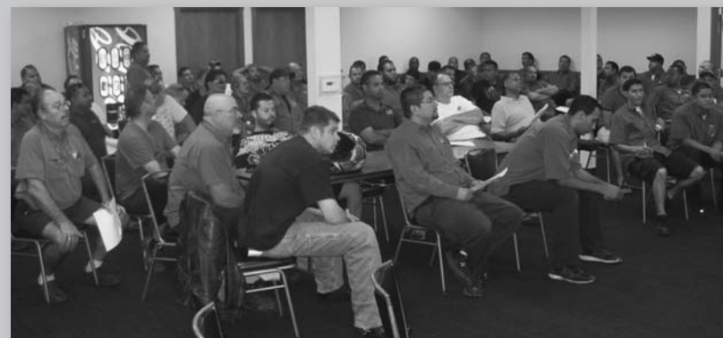
Pictured above: The ratification meeting.