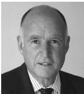
Governor Jerry Brown