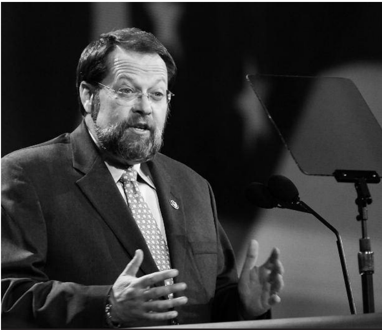
Rep. Steven LaTourette (R-OH) Addresses Delegates